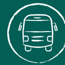
Transport and Outings